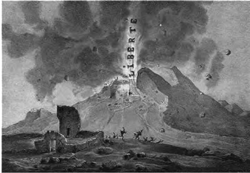
A French illustration from 1848 commenting on the events of that year.